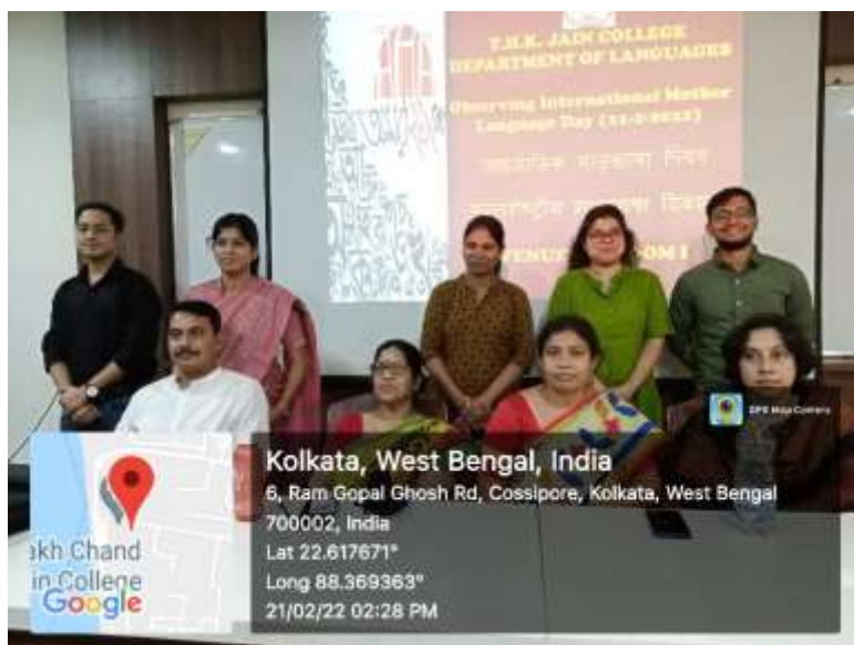
International Mother Language Day, 21 st Feb, 2022