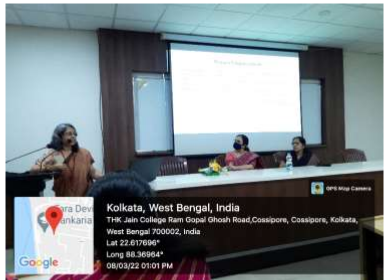
International Womens' Day, 8 th March, 2022