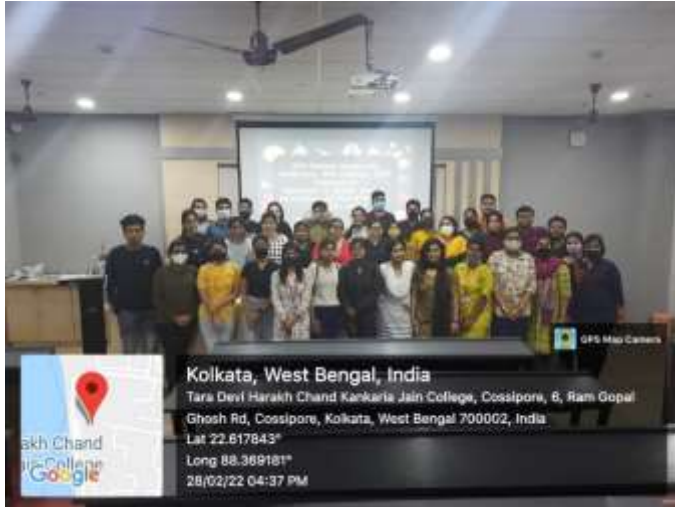
National Science Day, 28 th Feb, 2022