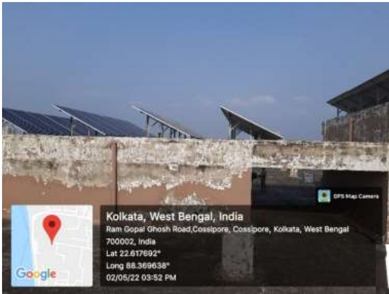
•Solar Panel on Roof-top